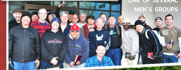
ONE OF SEVERAL MEN'S GROUPS