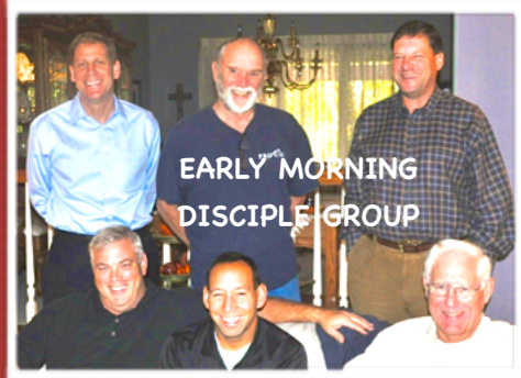
EARLY MORNING DISCIPLE GROUP