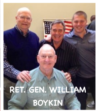
RET. GEN. WILLIAM BOYKIN