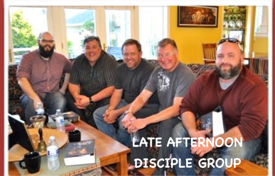
LATE AFTERNOON DISCIPLE GROUP