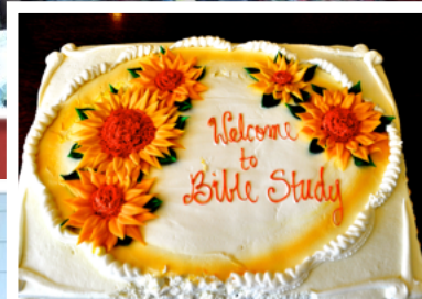
NOON BIBLE GROUP